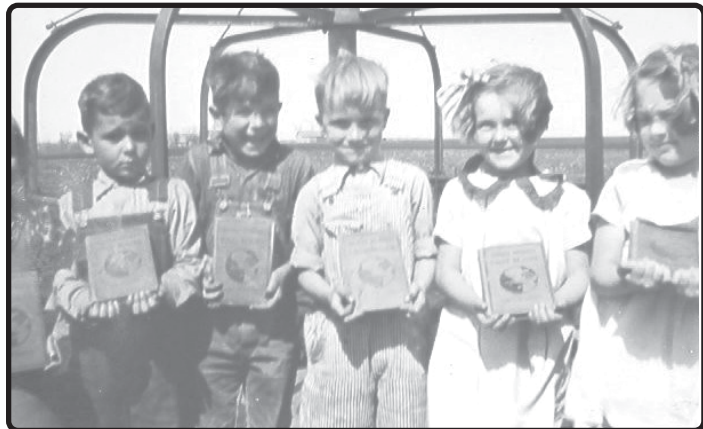
Alpha One Room School District No. 39 First Grade Student holding McGuffey Readers