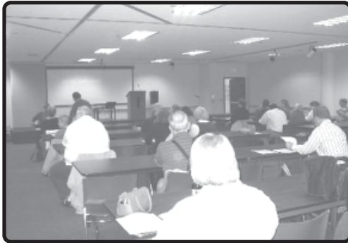
2004 KCAA Fall Symposium "Make New Friends, But Keep the Old: Preservation Strategies for Electronic and Paper Records"