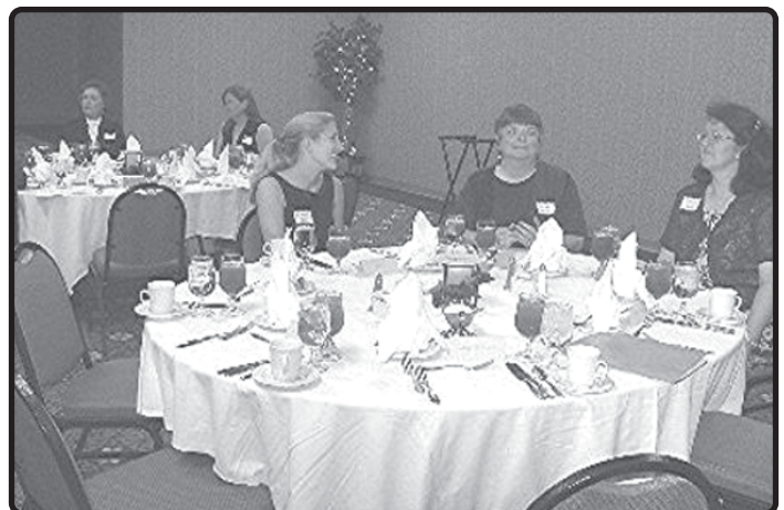
2004 KCAA Fall Dinner in Topeka, Kansas