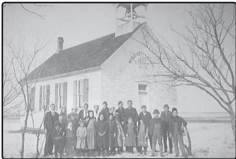
Wolf Creek One Room School District No. 26, 1902-1903