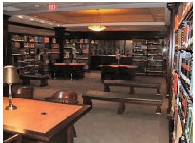
The Missouri Valley Room at KCPL Central Library