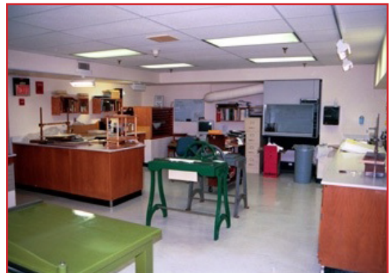
KU Libraries Stannard Conservation Laboratory

Tours of Kenneth Spencer Research Library, home to KU's archival, manuscript, rare book, and regional history collections will be offered as well.