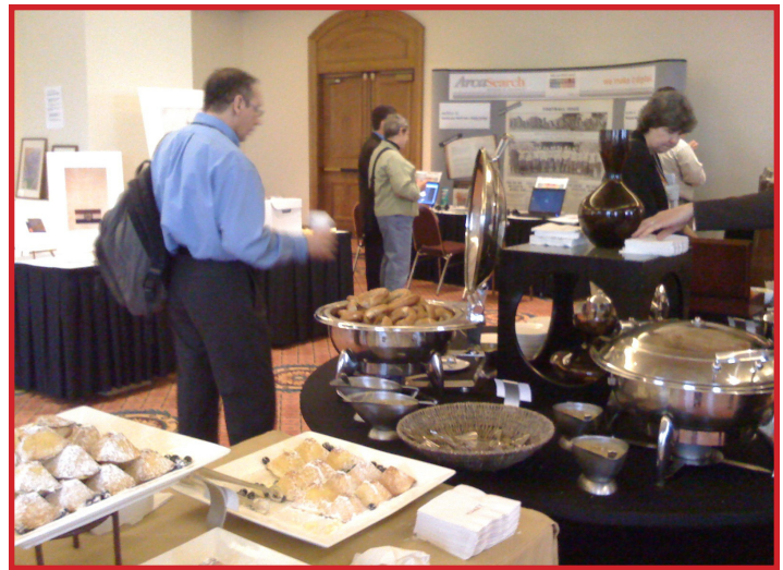
Afternoon coffee break at MAC annual meeting in St. Louis on May 1, 2009.

At our upcoming meeting on Wednesday, June 3, KCAA will present its annual awards. Who among you will be honored this year? Come and find out!