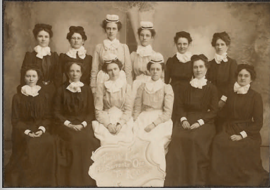
Fisk Class of 1907

“The rich heritage of the Kansas City National Training School is the story of courageous young women who ventured into the most dangerous and poverty-stricken areas of Kansas City to bring social services and hope to the poor”