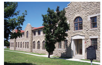
The Black Archives of Mid-America in it's new home!

Americans in the Midwest. Beyond our original emphasis of research and critical examination, the Archives' traveling exhibits personify the roles of African Americans and their plight to dispel negative images. Our interpretive and educational programs, research services and special projects have received overwhelming community support.