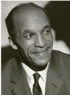
John B. McLendon at the time he was coaching the Cleveland Pipers; detail from a photograph "New Members of Pipers Team." Call number: RHMS P 606, Box 1, Folder 14

John B. McLendon, Jr. was born in Hiawatha, Kansas and graduated from KU in 1936 with a degree in Physical Education. While at KU, he studied basketball under its creator, Dr. James Naismith. Though not allowed to play on the varsity team at KU due to the university's color line, he could go on to an impressive career as a basketball coach. He won eight CIAA (Central Intercollegiate Athletic Association) championships. He also invented several facets of the game, including the fast break, zone press, and four corners offense.