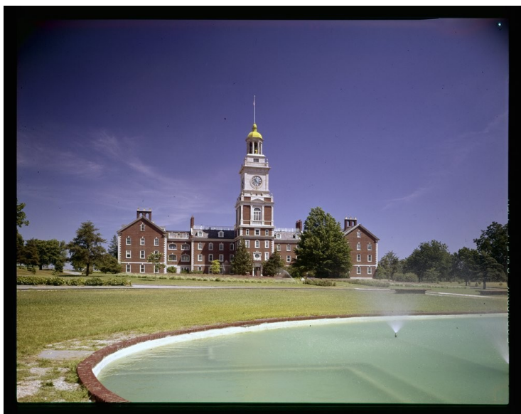
Tower Building, Menninger West Campus, Topeka, Kansas

Society. Descriptions of the records in the Menninger Foundation Archives are available in the Kansas Historical Society's Archives Catalog at http://kshs.org/archives . Selected records, including most of the Historic Psychiatry Collection and the photographs you see here, are on Kansas Memory, the Kansas Historical Society's on-line digital archives, at http://www.kansasmemory.org/locate.php?categories=4905-11669&