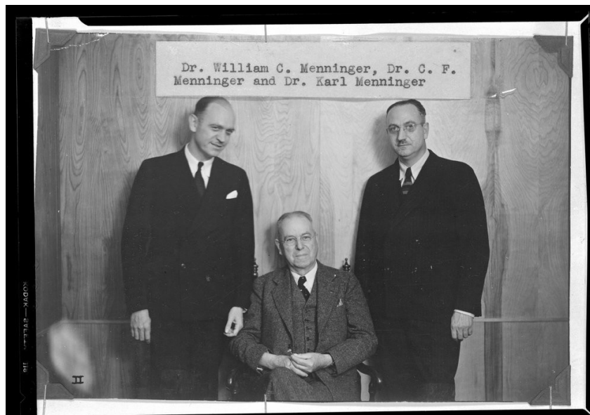
Dr. C. F. Menninger and sons - This undated photograph shows Dr. William C. Menninger, Dr. C. F. Menninger, and Dr. Karl A. Menninger.

The Menninger Foundation Archives includes papers of a number of members of the Menninger family, circa 1880 - 1992; corporate records of the Foundation, circa 1847 - 2002; and the Historic Psychiatry Collection, 1644 - 1991. The family papers include those of Dr. Karl Menninger, already the most heavily used and one of the largest portions of the collection. Dr. Karl was one of the founders and the author of numerous popular books on mental illness. The corpo-